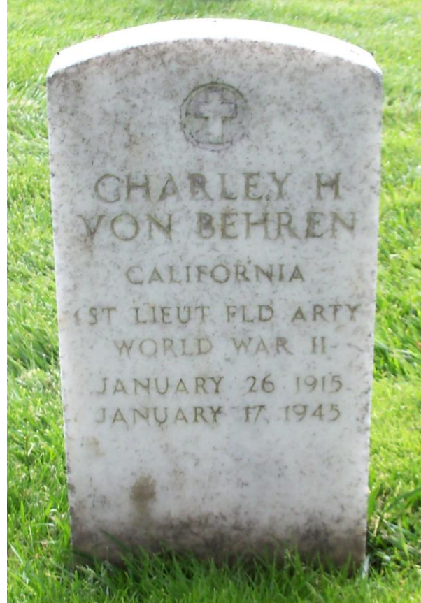
WW II Deceased returned from Foy-Bastonge, Belgium in 1949 Buried in Golden Gate National Cemetery, San Bruno, California Section K: Site 49