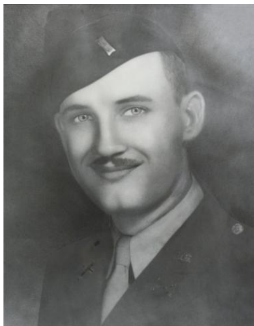
Medal of Honor

ID: O1181988 Branch of Service: U.S. Army Hometown: Waco, TX KIA April 6, 1945