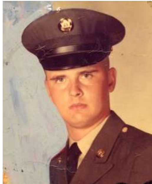
Linden High School, New Jersey 1964 Graduation Photo