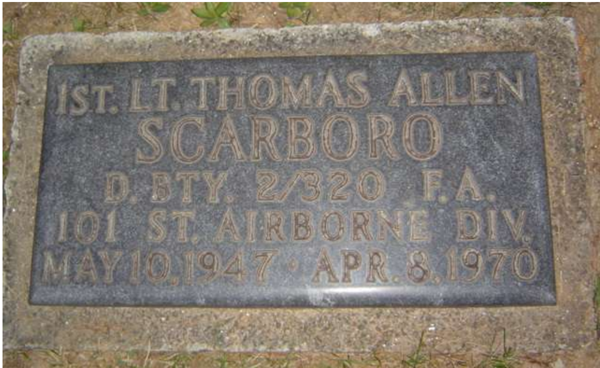
Forest Lawn Memorial Park Cemetery 1489 Sandhill Rd. Candler, North Carolina Section 7 Lot 341 Space 1