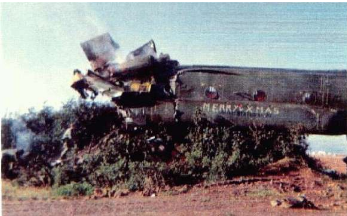
Wreckage of 66-19006