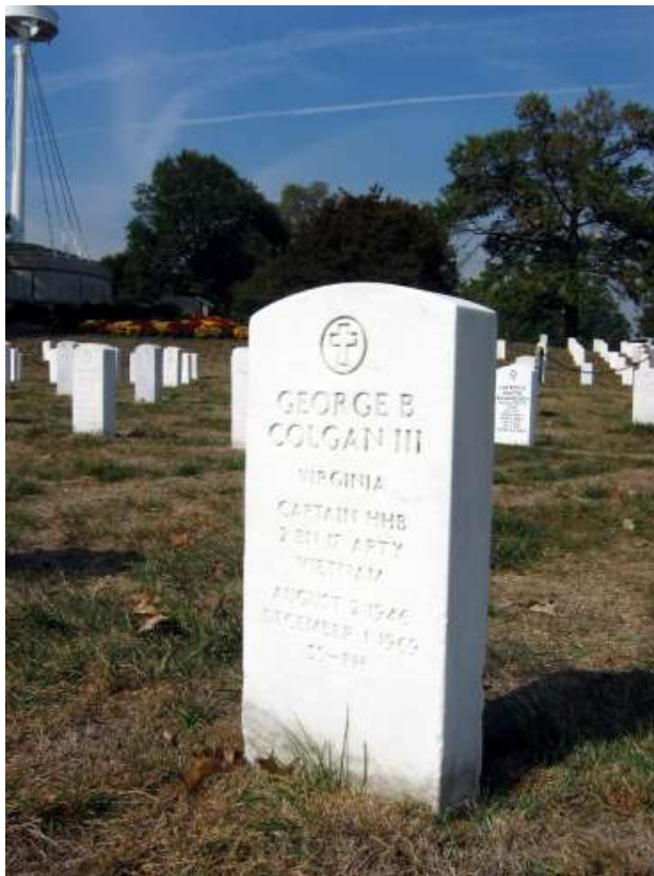
George is buried at Arlington National Cemetery Sec 46 Site 981-7